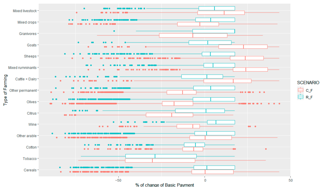
Figure 2. Distribution of abolishment effects per type of farming.

We present the distribution of the effects of the abolishment of historical entitlements for different types of farming in Figure 2. Here it is more apparent that the regional flat rate has significantly more moderate results compared to the countrywide flat rate. Especially for sectors like olives, wine and other permanent crops, while with the countrywide flat rate there are losses for the majority of farms, with the regional flat rate the losses are quite limited.